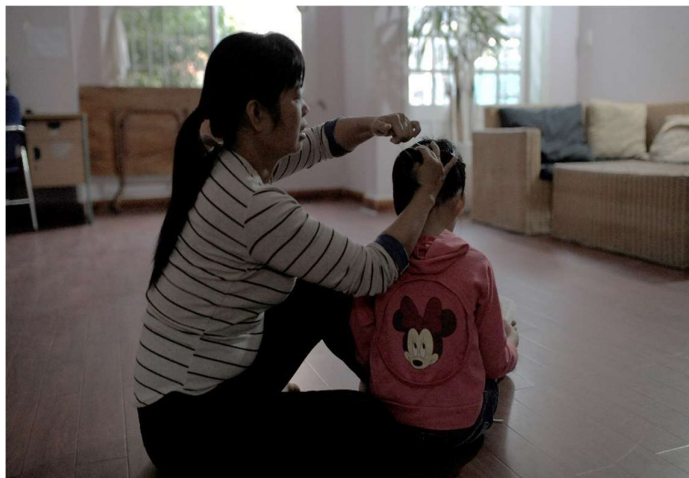
Mother and daughter at the Recovery Centre