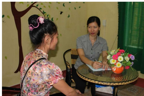
Client receiving counselling from Yen Bai Women's Union

As part of the project “Community based Satellite Care through a Centre for Gender based Violence Victim in Yen Bai province”, the Care Centre was established and it became a safe address where victims in Yen Bai and nearby provinces can seek protection. The Care Centre has two rooms with capacity to serve eight clients at any one time. Over 24 months, 25 clients and their dependents used this option, having become a safe address for women and children in crisis. This Care Centre provides local accessible, appropriate and practical services in a familiar cultural background.