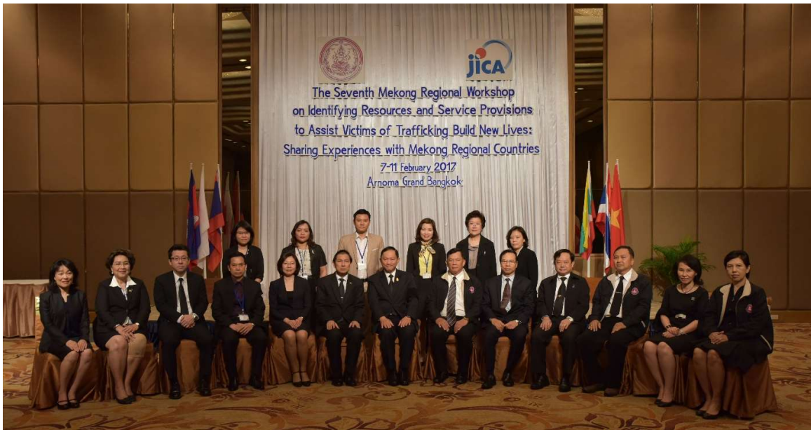
Vietnam representation in the Seventh Mekong Regional Workshop on “Identifying Resources and Service Provision to Assist Victims of Trafficking Build New Lives Sharing Experiences with Mekong Regional Countries”

Hagar staff had opportunities to visit different models of client care through participation in national and international workshops. We share Hagar’s approach in national and regional workshops at the request of the Government of Vietnam, Social Work institutions, IOM, etc. This included participation in August in the Asian Women Shelter Network workshop in Taiwan. At the Seventh Mekong regional workshop in Thailand, focusing on “Efforts on Repatriation and Social Reintegration of Trafficked Persons”, Hagar led the presentation of Vietnam’s situation and practices related to trafficking, which included a Hagar client story, and information about our model.