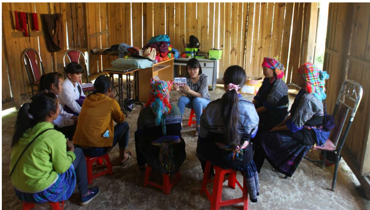
Life skills training for economic empowerment group in Yen Bai province

Hagar organised trainings for small groups of clients focusing on suitable topics of interest. A Loans and Savings group of women survivors of domestic violence in Yen Bai province learnt about domestic violence protection laws, how to respond to instances of domestic violence, and learnt strategies to stop violence at home. Women who wanted to access a loan, were required to ensure their husbands attended trainings about domestic violence legislation, etc. An external evaluation finding was that after one year, all savings group women reported drastically reduced incidence of violence at home.