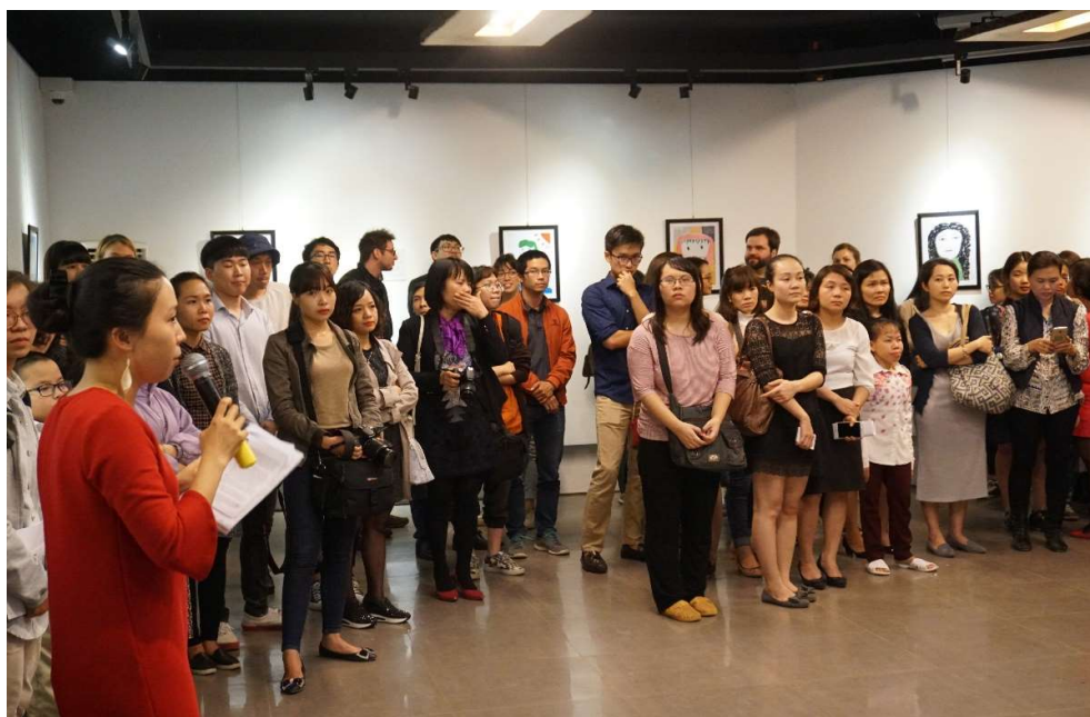
Opening of Hagar Vietnam’s “Rising from Broken” art exhibition