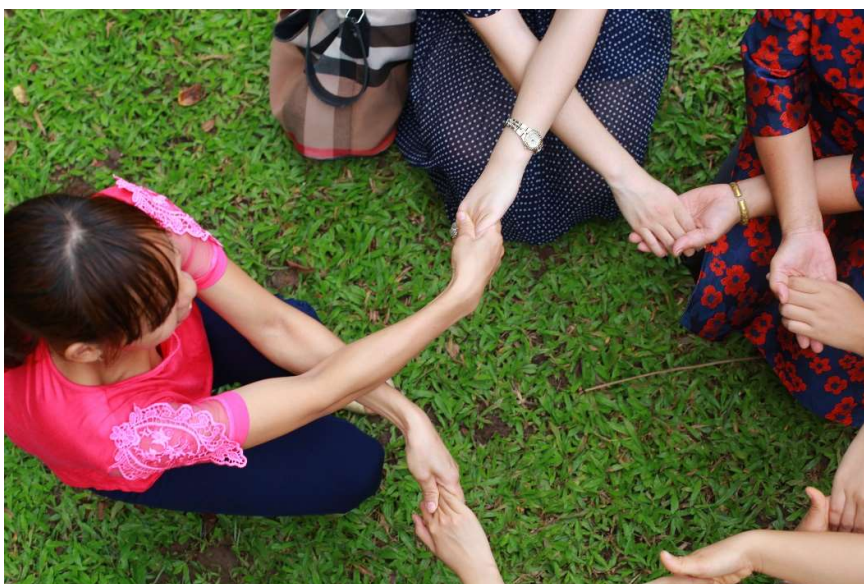
Building relationships amongst Hagar clients and staff

More than 90 percent of Hagar clients suffer from trauma and psychological issues such as anxiety, depression, post-traumatic stress disorder (PTSD) and social phobia. When a client comes to Hagar, they might have experienced chronic and complex trauma, which can be observed through different symptoms, such as detachment, behavior and emotional disorder, suicide attempts, self-harming and