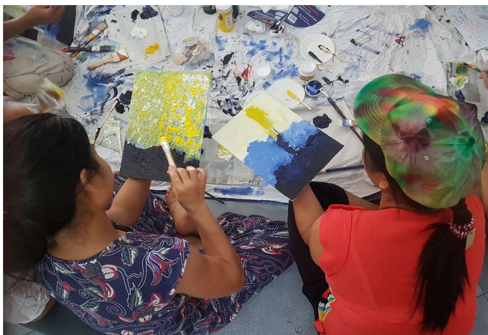
Art therapy sessions